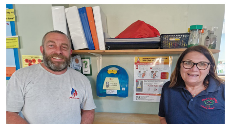
Cherrytree Nursery School, Ashford (Kindly donated by AK Air Conditioning LTD)