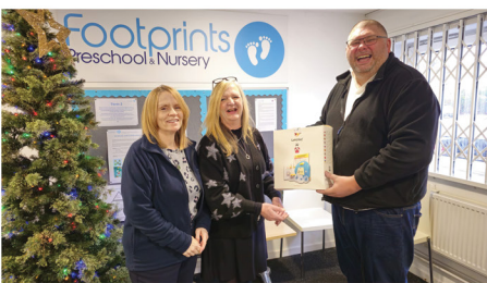
Footprints Pre-School & Nursery, Ashford