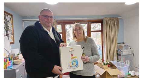
Cr8tive Play, Ashford