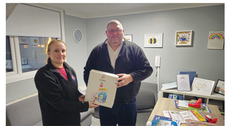
Happy Days Nursery, Iwade