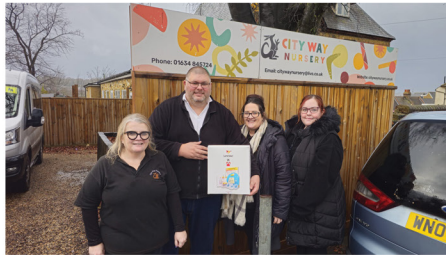
City Way Nursery, Rochester