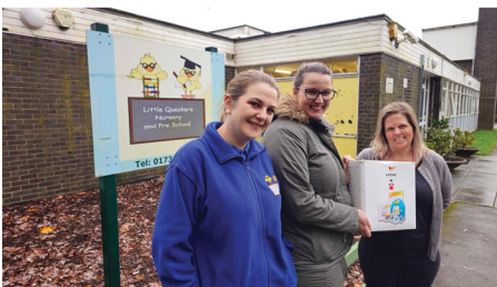
Little Quackers Nursery & Pre School, Maidstone