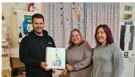
Bombini Tribe Day Nursery, Ashford (Kindly donated by Miles Signs)