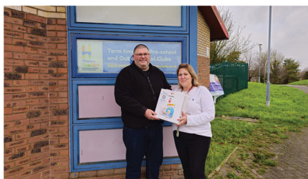
Towers Tiny Tots Pre-School, Ashford