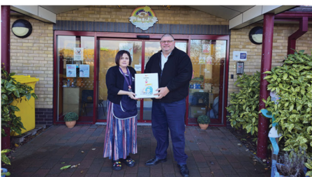
Little Ark Pre-School, Ashford (Kindly donated by ACE Movements LTD)