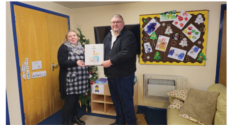
Kaleidoscope Childcare, Aldington