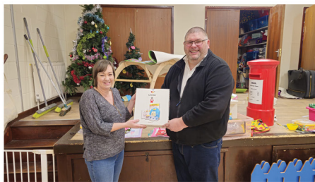
Godinton Playschool CIC, Ashford